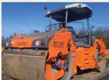
2016 HAMM HD+120i-VO 1,912 Hours - OROPS, 78" Tandem Roller Vibratory & Oscillating Drum E00037450 $48,000