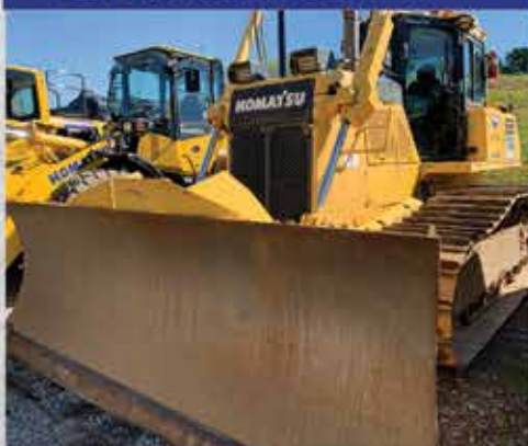
2016 Komatsu D65PXi-18

Machine Price $159,500 Section 179 Cash Tax Savings — $55,650 Your Cost After Tax Savings $103,350