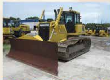
2016 Komatsu D65PXI-18 4,426 Hours - Cab A/C PAT Blade E00044776 $159,500