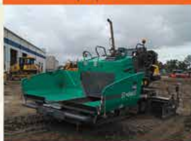
2019 VÖGELE Super 1300-3i 11 Hours - Tracked Asphalt Paver Max 16.5 Foot Paving Width E00046457 $206,500