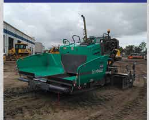
2019 VÖGELE Super 1300-3i

Machine Price $206,500 Section 179 Cash Tax Savings — $72,275 Your Cost After Tax Savings $134,225