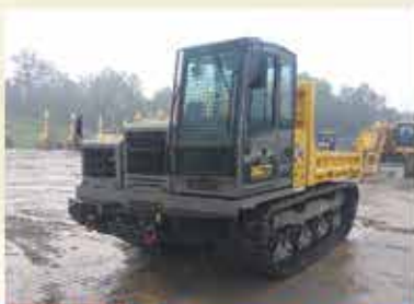
2018 Terramac RT9 296 Hours - Cab A/C 9-Ton Rubber Track Carrier E00044730 $158,000

Feast Your Eyes On This Quality Used Fleet Equipment