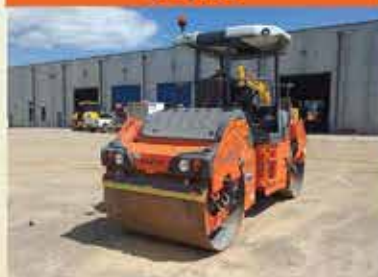
2017 HAMM HD+70i-VVHF 1,348 Hours - OROPS 59" Double Drum Vibratory Roller E00042398 $57,000