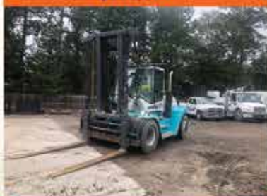
2017 KoneCranes SMV10-600C 64 Hours Straight Mast Lift Truck E00041782 $79,500