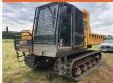
2017 Terramac RT14R 1,473 Hours - 14-Ton Rubber Track Carrier With Rotating Bed E00051573 $159,500